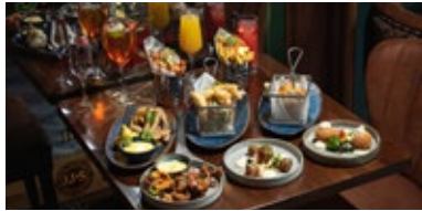
BOTTOMLESS BRUNCH FOR TWO £79.90