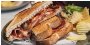
BREAKFAST/LUNCH IN THE LOBBY LOUNGE Monetary Value of Choice