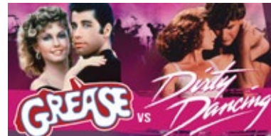
TICKETS TO GREASE V DIRTY DANCING ON 28/3/25 Tickets from £20