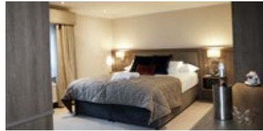
OVERNIGHT STAY From £159