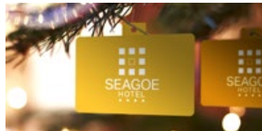
GIFT CARD Monetary Value of Choice