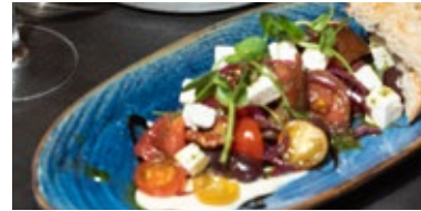
LUNCH/DINNER IN THE COURTYARD RESTAURANT Monetary Value of Choice