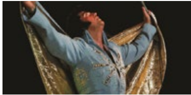
TICKETS TO ELVIS SPECTACULAR ON 21/2/26 Tickets from £20