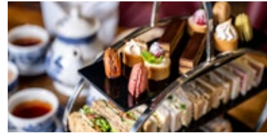
AFTERNOON TEA FOR TWO £69.90