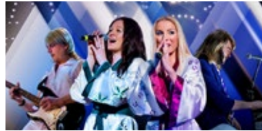
TICKETS TO ABBA REVIVAL ON 31/1/26 Tickets from £20